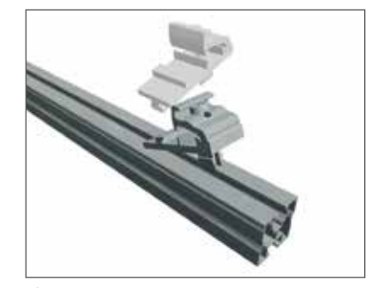
Hook in laterally and twist.