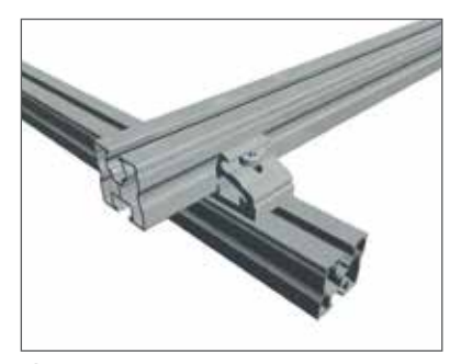
3 Position the rail and bolt together from above.