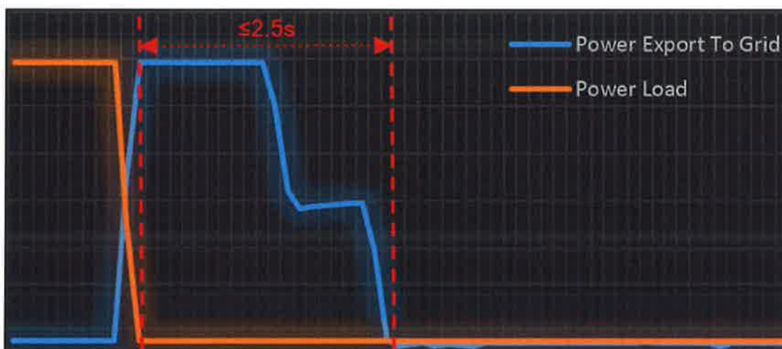
Figure 2. Control Result